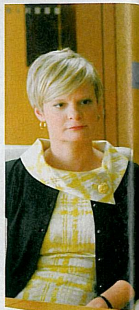
Martha Plimpton and Michael J. Fox both guest-starred in the April 29 episode