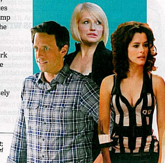
(From left) Seth Meyers on The Mindy Project ; Ellen Barkin on Modern Family ; Parker Posey on New Girl

Mindy Kaling's cool factor helped persuade pals like Ed Helms and Seth Meyers to appear on her freshman laffer.