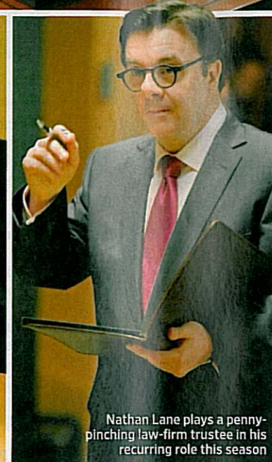
Nathan Lane plays a penny-pinching law-firm trustee in his recurring role this season