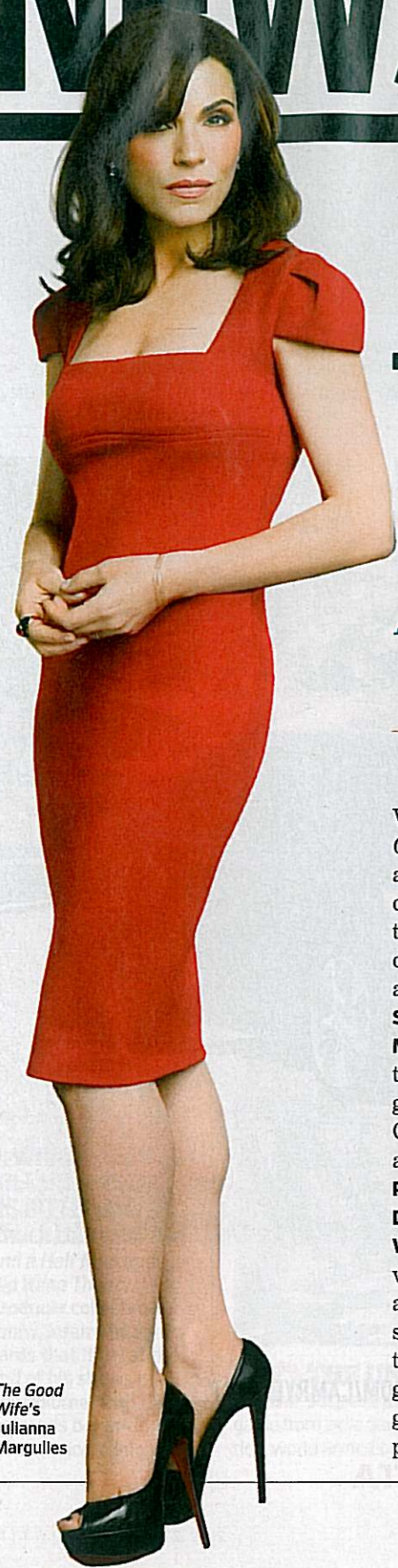
The Good Wife's Julianna Margulies